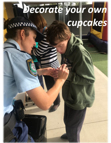
Decorate your own cupcakes